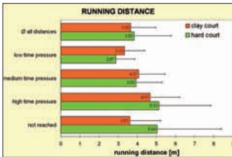
Figure 2 Average values and standard deviations to the running distance in time pressure situations in clay and hard court tennis

The results not only show a dominance in running sideways, but also demonstrate clearly that on average in all time pressure situations especially to the forehand (FH) side, longer distances have to be covered when compared to the backhand (BH) corner. Particularly in the observation category of medium and high time pressure, a mean running distance of four to five metres to the forehand can be determined (Figure 3).