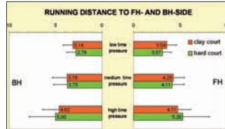
Figure 4 Error rate in selected match situations. Progress of the error ratio in selected match situations

It has to be emphasised that the percentile amount of errors on the forehand side as well as the forehand stroke, with the exception of the results under medium time pressure, preponderates. In the match situations under medium time pressure the error ratios of the backhand (28.2% versus 16.3%) and in the backhand corner (27.0% versus 16.8%) in clay court tennis differs substantially compared to those of hard court tennis (Tables 2 and 3). The relative frequency of the runs to the forehand side and to the forehand stroke, however, remains almost the same.