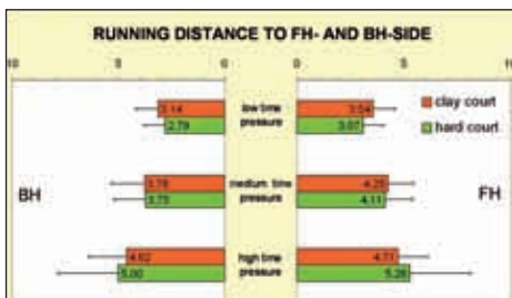
Figure 3 Running distance to the FH and BH sides. Average values and standard deviations to the running distance differentiated for the forehand (FH) and backhand (BH)

The error ratio differs between the two tournaments, concerning runs to the court side as well as to the stroke. In clay court tennis, the error ratio under time pressure (net and out) is higher than one fifth ( n=184 ), whilst on hard courts, the amount of faults lies at about 19%. The differentiated analyses regarding the three time pressure situations, as well as the court and stroke side, also show that clay court tennis has a higher error ratio than hard court tennis (Figure 4).